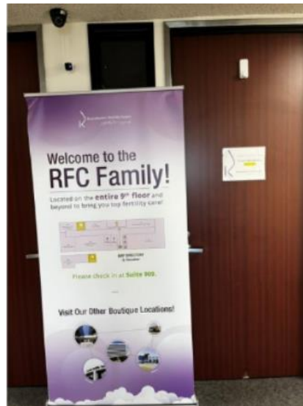
Turn right toward the banner