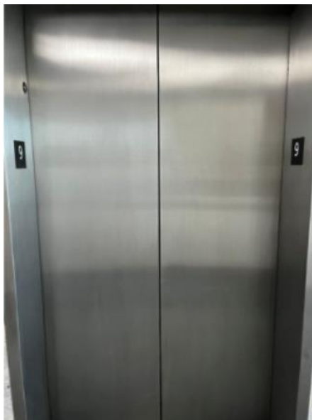
Proceed to the 9th floor