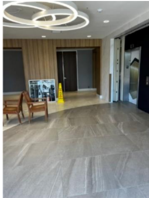
First Floor Elevator